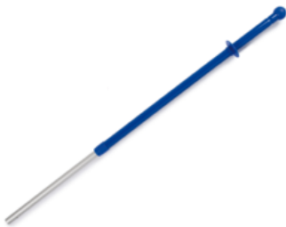
Telescopic handle ergonomic aluminium