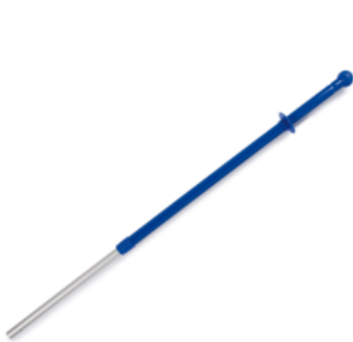
Telescopic handle ergonomic aluminium