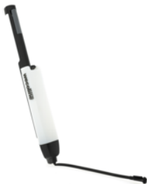
Carabao spray unit