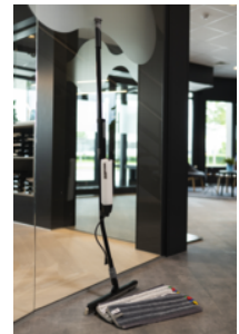
Carabao floor set