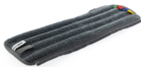
Carabao flat mop